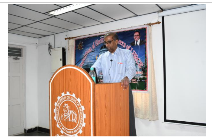
Lecture Delivering by Resource Person