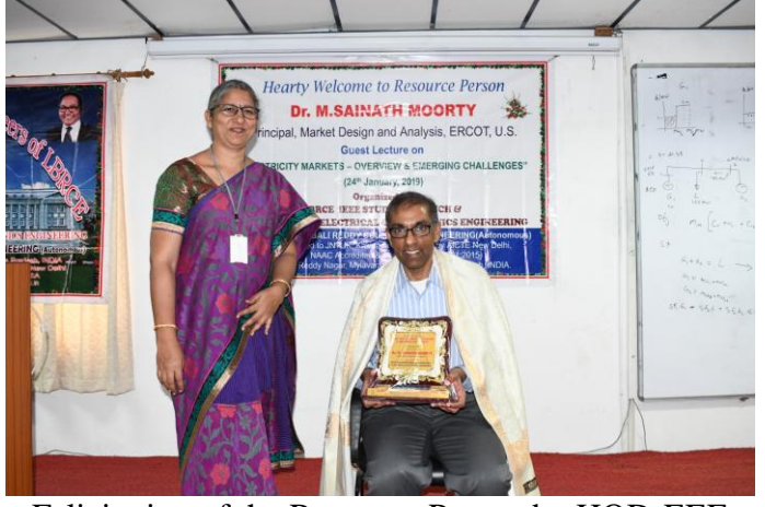
Felicitation of the Resource Person by HOD-EEE